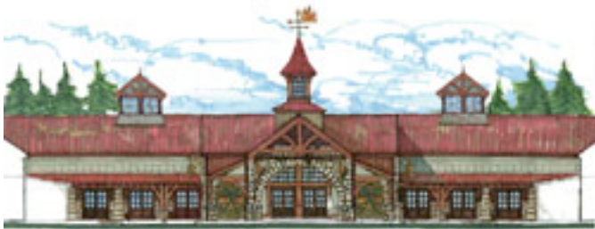
New front view Porte Cochere entrance at Legacy Lodge & Conference Center