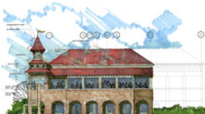
Expanded dining area and outdoor enhancement to Windows Restaurant

The Legacy Lodge & Conference Center guest rooms have already been fully renovated with upgraded amenities that bring a taste of the city life to the great outdoors. Now, the final phase of renovations to the hotel finishing up. The exterior front entrance Porte Cochere is being completely redesigned and due to be completed May 2008. Wood shake siding, copper rake flashing, wood timber trusses, and natural stone are just some of the new textures you'll see. Exterior walls, entryways and corridors will be accented with rustic lamp fixtures and accessories that will wow you from the moment you drive up.